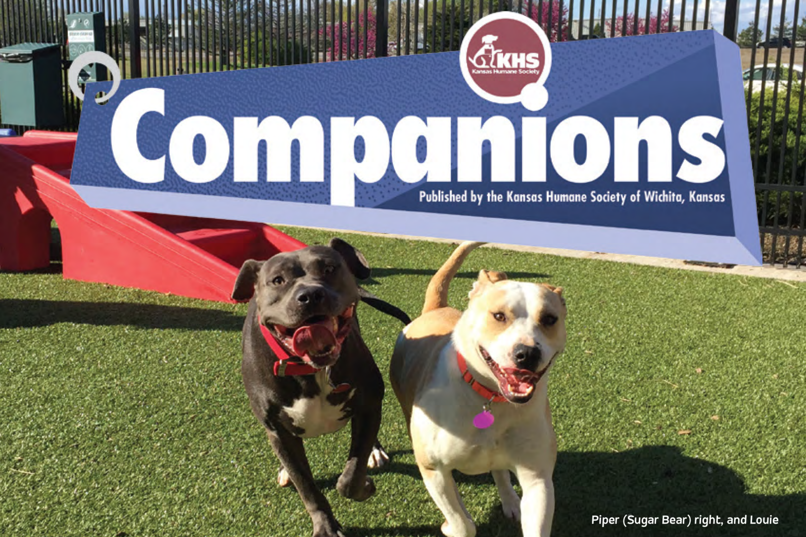
Piper (Sugar Bear) right, and Louie

Published by the Kansas Humane Society of Wichita, Kansas